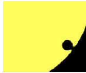
Figure 3. Venus seen against the solar disc, showing the 'black drop' phenomenon that made it difficult to establish the exact instant of contact.

Other expeditions went to French territories: Le Gentil de La Galaisière was unable to disembark at Pondicherry, which had just fallen to the British. Alexandre-Guy Pingré's journey to the island of Rodrigues (near Mauritius) fell victim to British pirates, who scuppered his boat and stranded him on the island for 100 days without supplies. His return journey was no better; his boat was hijacked by the Royal Navy near Lisbon, from where he was forced to return to Paris by ox-cart.